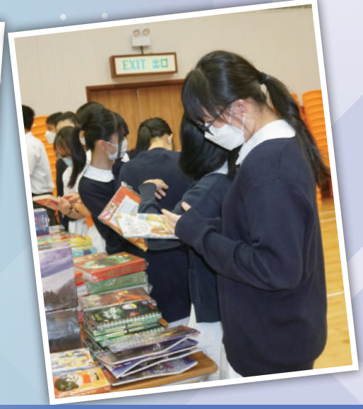
STEM Book Fair 2023